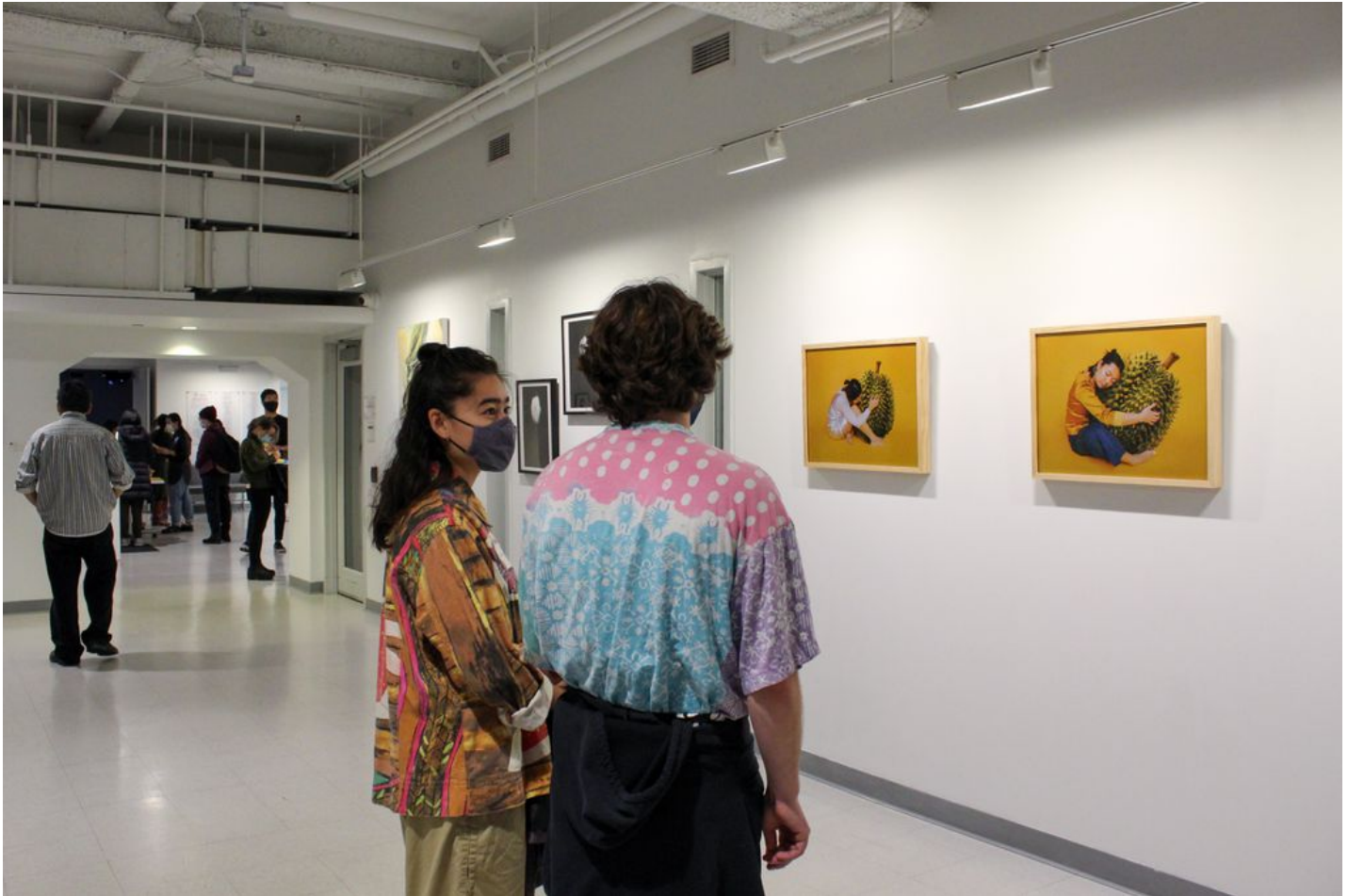
Attendees at Pao Arts Center's first art crawl in 2021, where the "New Narratives: Embodied Identities" exhibition was on display.